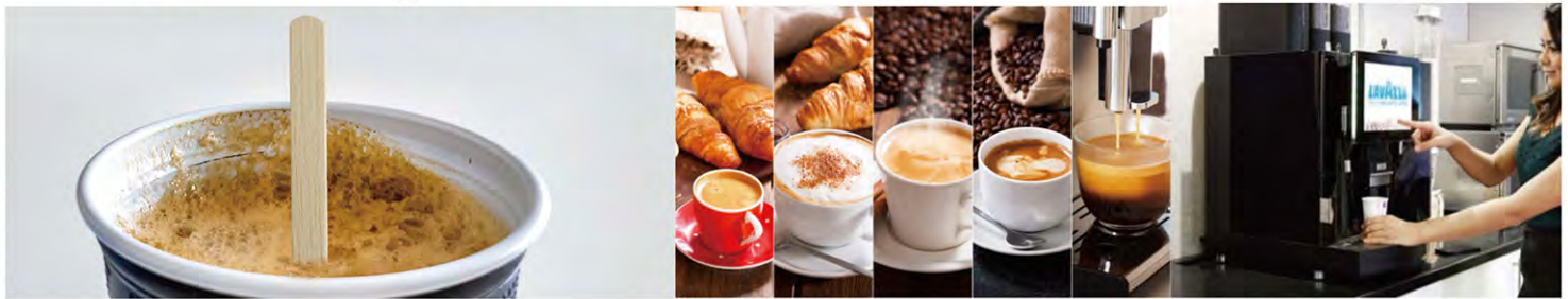
Bamboo vending stirrer for auto coffee vending machine