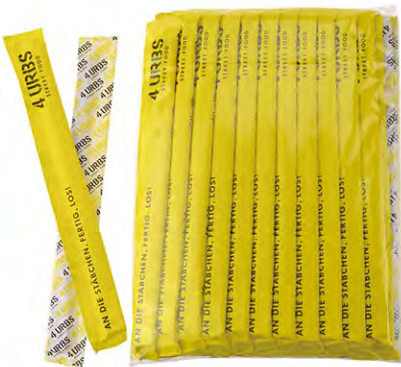
Aspen/Birch Genroku Packing: 100pairs x 40bags/ctn