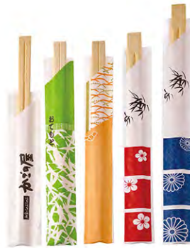
Open paper wrapped chopstick Logo printing can be customized