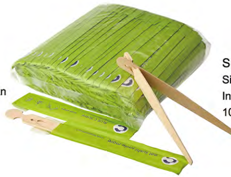
Snack stick Size: 150 x 18 x 1.5mm Individual paper wrapped 100pairs x 10bags/ctn