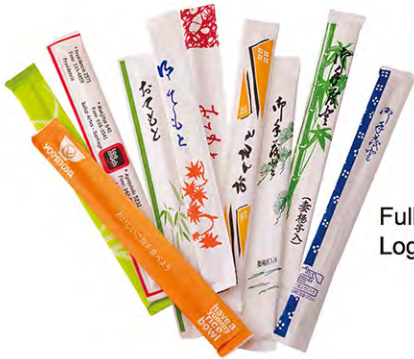
Full paper wrapped chopstick Logo printing can be customized