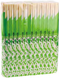
Aspen/Birch Genroku Packing: 100pairs x 40bags/ctn