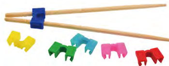
Plastic holder Size: 30 x 9 x 16mm Packing: 500pcs x 20bags/ctn