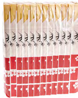
Bamboo tensoge/twin Packing: 100pairs x 20bags/ctn