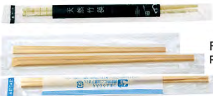
Full cello wrapped chopstick Packing: 100pairs x 40bags/ctn