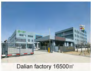
Dalian factory 16500m 2