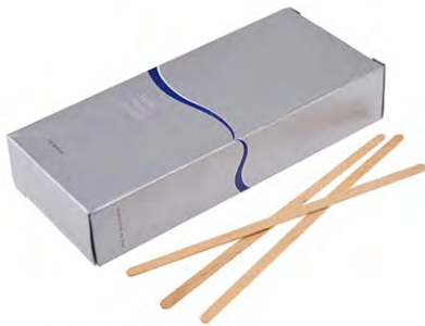
Wooden spatula Size: 140 x 6.5 x 1.4mm Packing: 100pcs x 100boxes/ctn