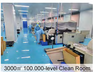
3000m 2 100.000-level Clean Room