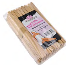
Wooden spatula Size: 140 x 6.5 x 1.4mm Packing: 100pcs x 100bags/ctn