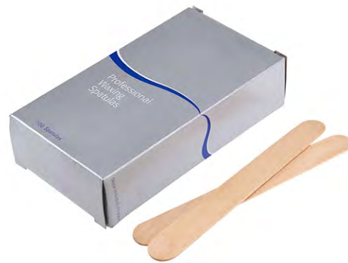
Wooden spatula Size: 150 x 17.5 x 1.5mm Packing: 100pcs x 50boxes/ctn