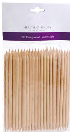
Manicure stick Packing: 100pcs/bag Size: 3.8 x 100mm