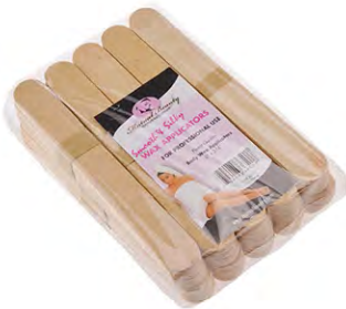
Wooden spatula Size: 150 x 17.5 x 1.5mm Packing: 100pcs/bag