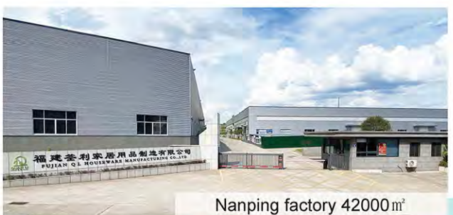
Nanping factory 42000m 2